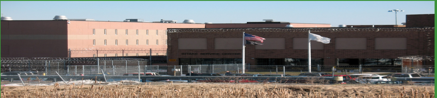
Pictured above is the Anthony P. Trivisono Intake Service Center (ISC). The ISC only houses male offenders and was consequently responsible for processing the vast majority of all commitment and release events during CY2022.